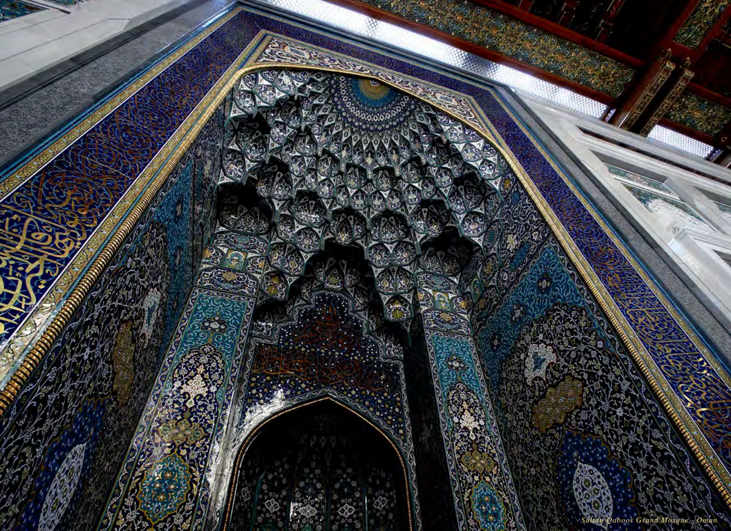
Sultan Qaboos Grand Mosque - Oman