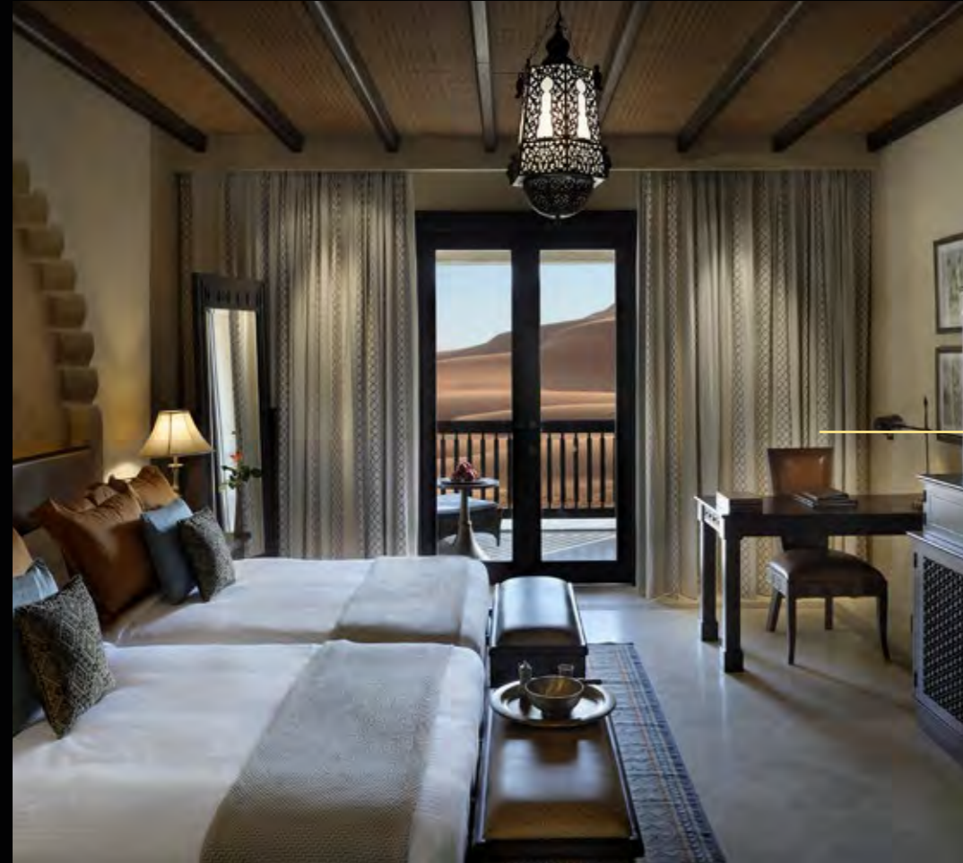
Qasr Al Sarab Desert Resort by Anantara