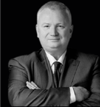
Design Director Corporate Sobha Group