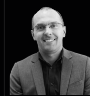
Head – Quality & Technology Sobha Group

A seasoned professional in the field of architecture, engineering and construction (AEC) with more than 27 years of work experience possessing a Master Craftsman in Civil construction and a BA in Architecture education from Germany. In his current stint with Sobha Group, he oversees and engages in project design and implementation using an independent technical inspection regime from developers side which is spearheaded by German Master Craftsmen ensuring European/German Master Quality utilizing internationally renowned construction productivity software.