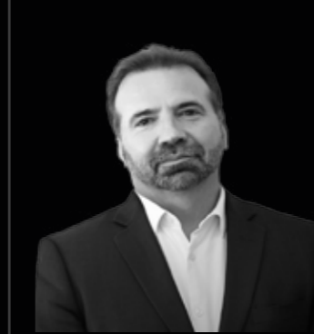
Head – PNC Architects Sobha Group