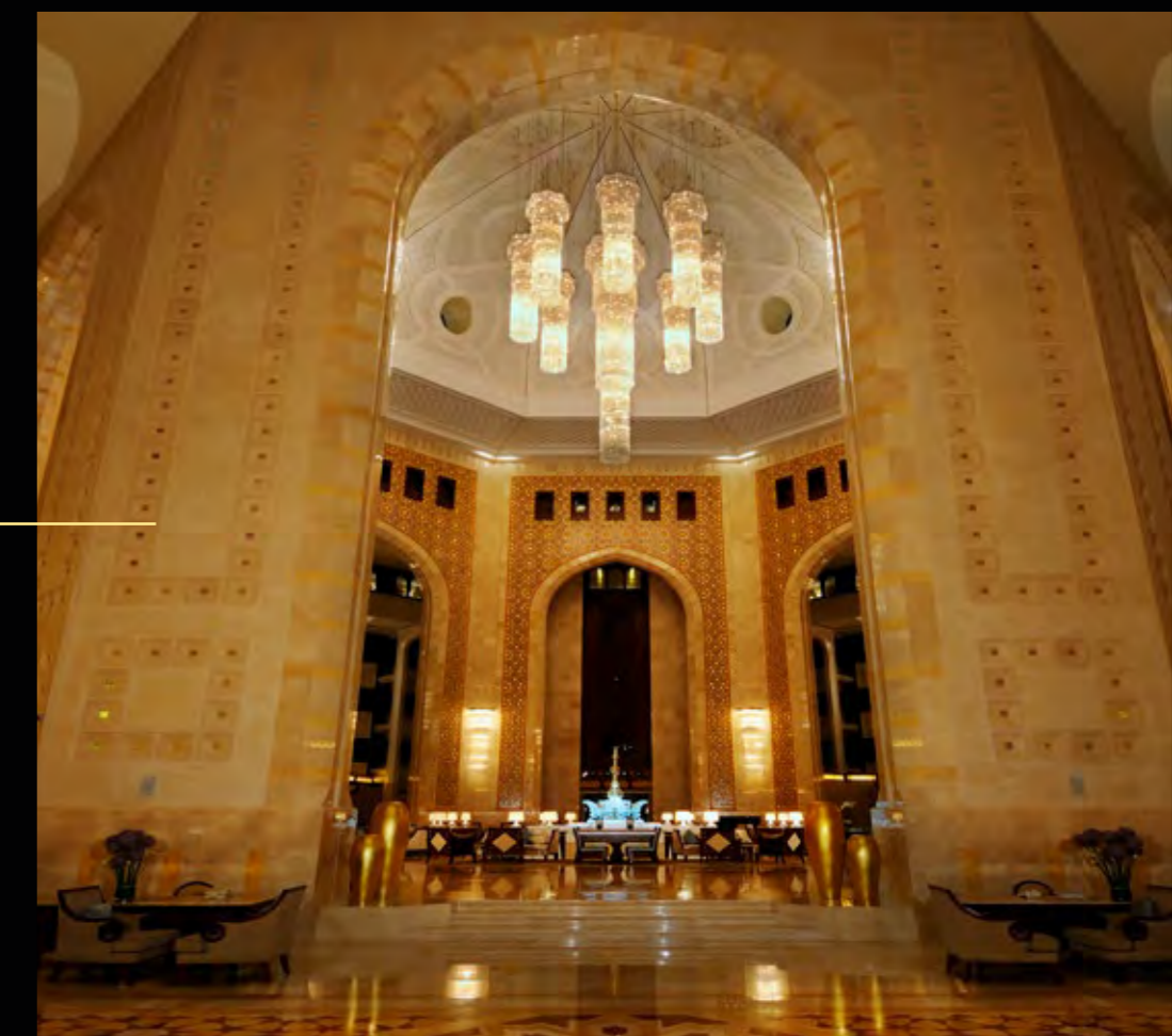
Al Bustan Palace Hotel - Oman