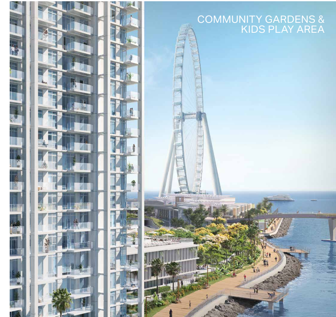
COMMUNITY GARDENS & KIDS PLAY AREA