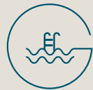
The Canal Pool