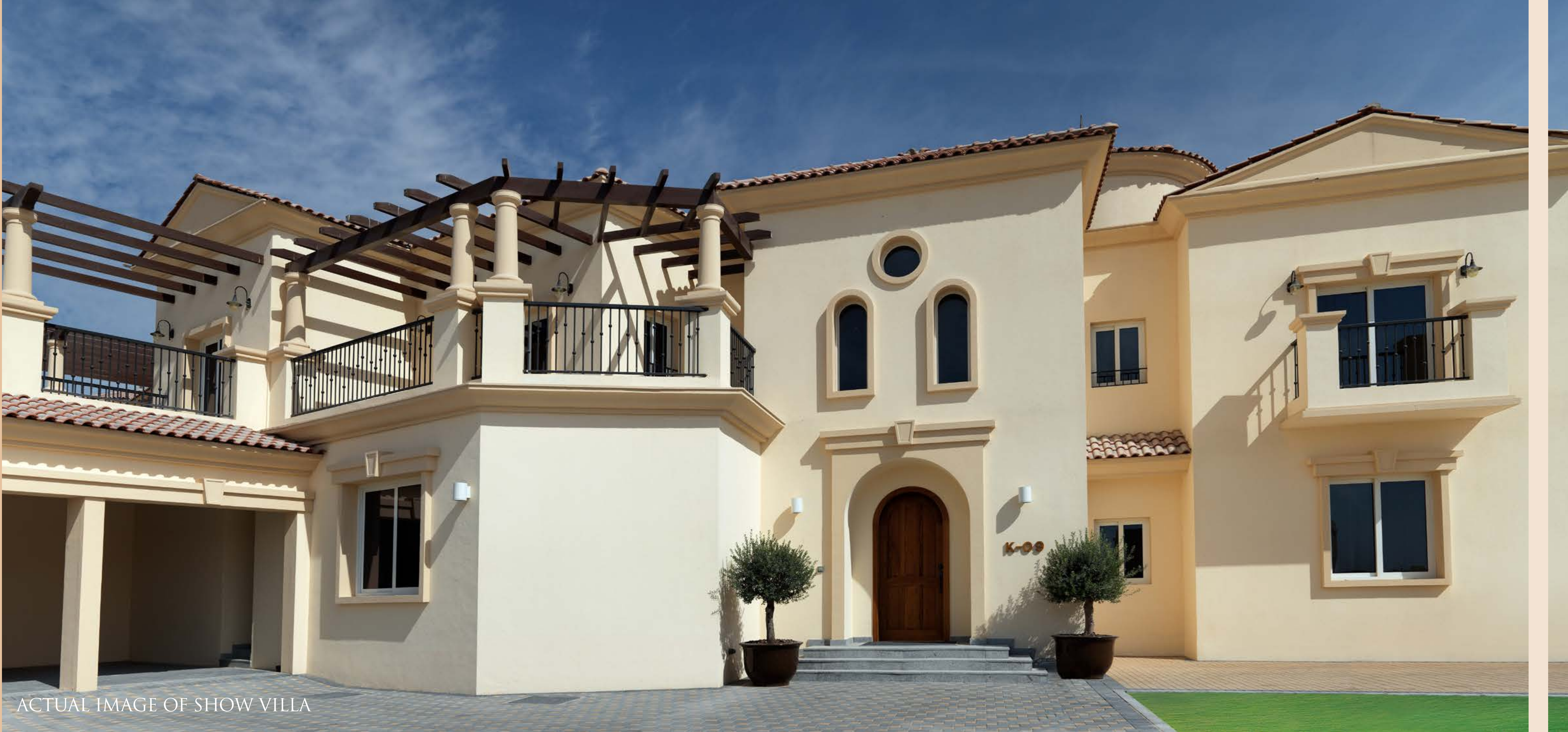
ACTUAL IMAGE OF SHOW VILLA