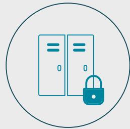
Changing rooms and lockers