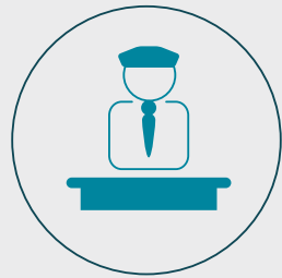
Spacious lobbies with concierge service