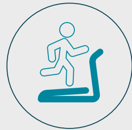
Stand-alone bespoke gym