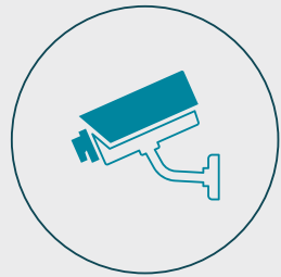
Safe & secure residential building