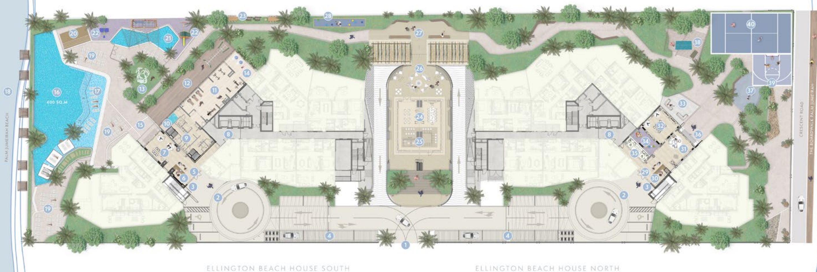
ELLINGTON BEACH HOUSE SOUTH