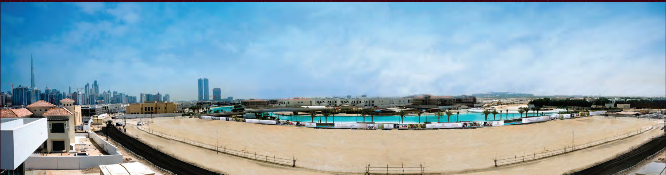
Aerial view of plots.